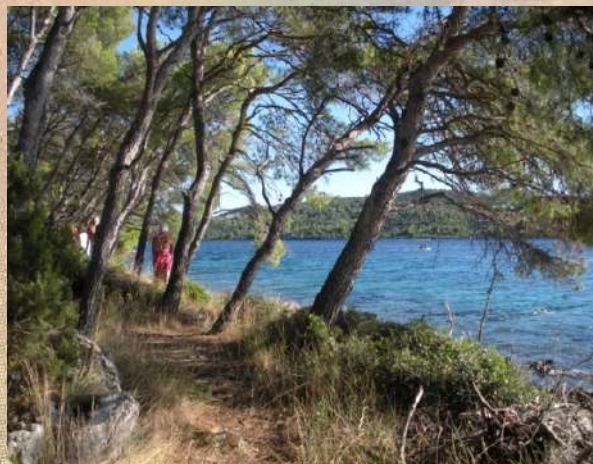
boat trips from the hotel to the nearby islet Rudnjak

The price of the 11 day-course is € 400 per person. The cost of transport from the airport to the hotel is approximately € 8 one way. If you are travelling by car, please contact us for route details and for booking the car ferry in advance. You could arrive on Saturday September 6. The program starts on Sunday morning and finishes on Wednesday September 17. around noon. You can of course arrive at the hotel days before the course (higher prices because still 'high season') and leave later than September 17.