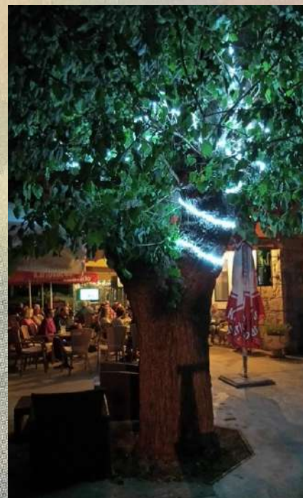
after evening dances there is time for a glass and a chat

Iž offers everything needed to ‘get the best out of ourselves’. Beautiful and peaceful, it offers quiet little rocky beaches where you can be private and small country lanes for walks. The sea is crystal clear and the temperature of the water is pleasant. We enjoy on a half board basis the great vegetarian and vegan food of our hotel. The participants to the dance course come from various countries and they all add their own lovely energy to the total. In short: it is the ideal setting for recharging our batteries and at the same time together sending out into the world the beautiful and subtle energy that is created in the dancing.