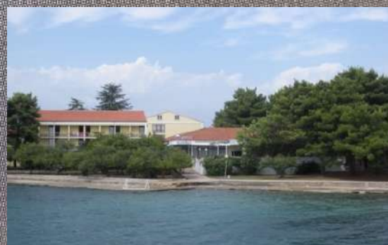
Hotel Korinjak 50 meters from the sea

And everywhere nature is nearby; everything in a nutshell!