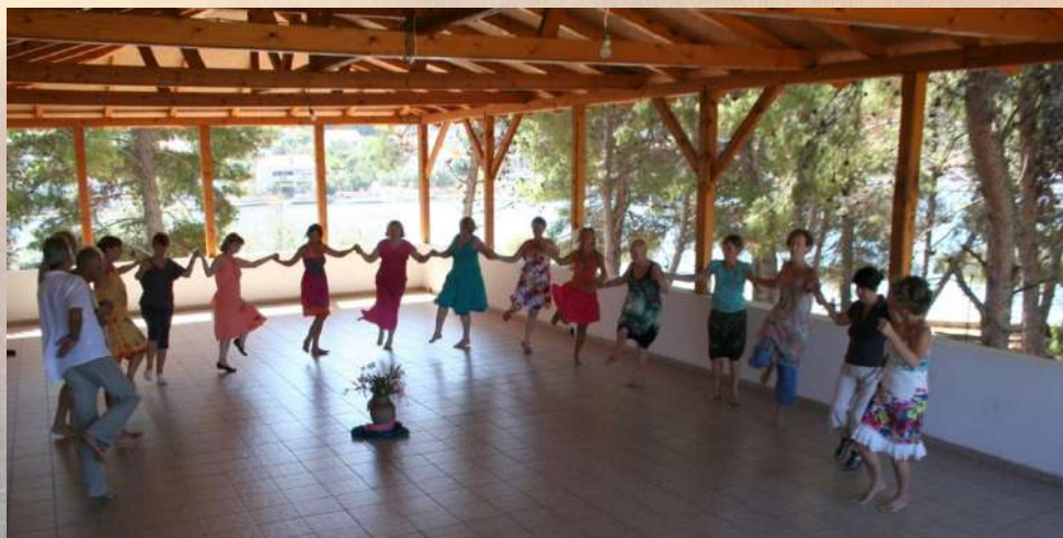
The terrace on which we dance is open to three sides so we can see the sea and the olive trees