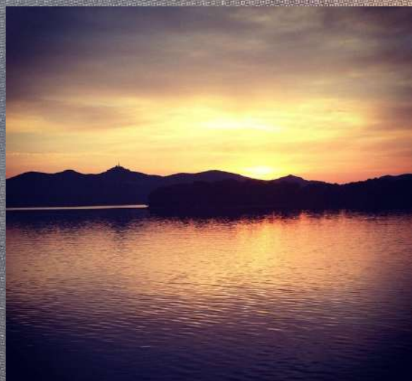
Sunrise over the neighboring island Ugljan

Each day we will dance in the morning and part of the evening, leaving the long afternoon for you to spend exactly as you prefer: rest, walk, swim etc. Within a few minutes’ walk you will find two small supermarkets, a post office and several nice cafes and restaurants.